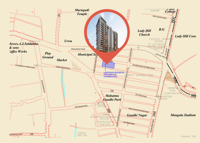
Site Address: Gandhinagar, Mannagudda, Mangalore