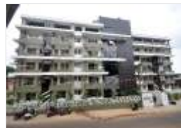
Adonia Alvares Road, Kadri, Mangalore