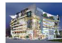
Milestone 25 Balmatta, Mangalore