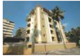
Astoria Balmatta, Mangalore