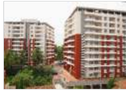
Sai Grandeur Opp. Capuchin Fiary, Jail Road, Mangalore