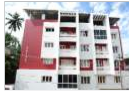
Aria Alvares Road, Mangalore