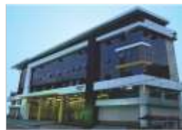
Aadheesh Off M.G. Road, Mangalore