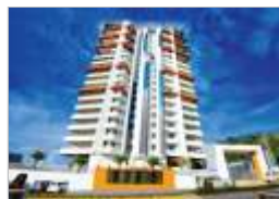
Atlantis Bendoorwell, Mangalore