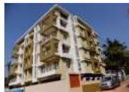
Brookside Morgan's Gate, Mangalore