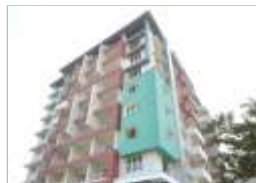
Danube Balmatta Road, Mangalore