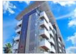
Ourania Kadri Toll Gate, Mangalore