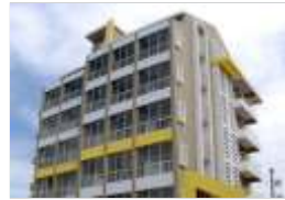
Hathill Crest Hat Hill, Mangalore