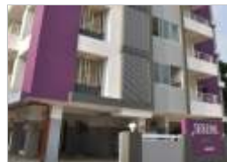
Serene Bejai, Mangalore