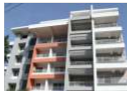
Hillside Ferns Shivbagh, Mangalore