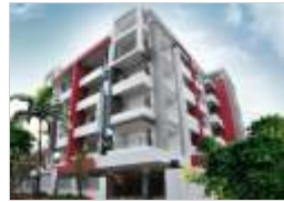
Pushkar Car Street, Mangalore