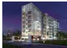
Insignia Valencia, Mangalore