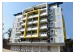
Vasundhara Opp. Urva Marigudi Temple, Mangalore