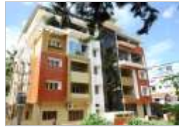
Orion Lobo Lane, Mangalore