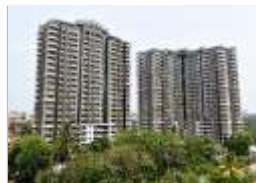
Maurishka Palace Near CV Nayak Hall, Kadri Kambla, Mangalore