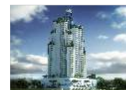
Solitaire Hathill, Mangalore