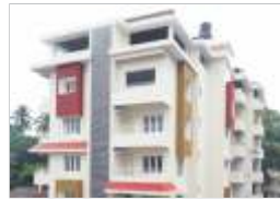
Aadhee Lobo Lane, Mangalore