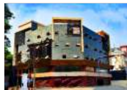
Parin Collector's Gate, Balmatta, Mangalore