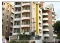
Rehoboth Bejai, Mangalore