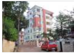
Eesha Lobo Lane, Mangalore