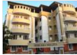
Mercara Heights Mercara Hill Road, Bendore, Mangalore