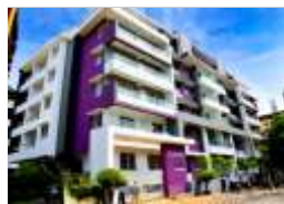
Aquarius Mallikatta, Mangalore