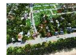
Emerald Bay Surathkal, Mangalore