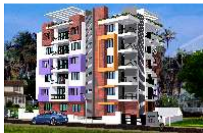
Vijaya Lobo Lane, Mangalore