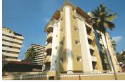
Astoria Balmatta, Mangalore