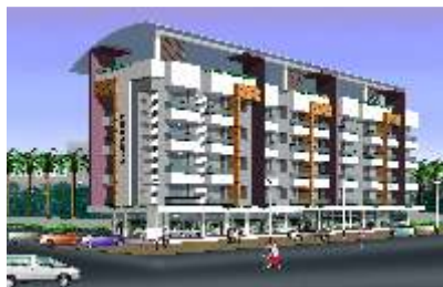
Ourania Kadri Toll Gate, Mangalore