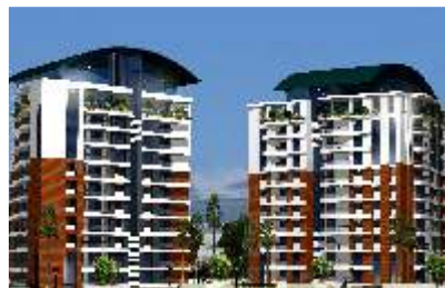
Sai Grandeur Opp. Capuchin Friary, Jail Road, Mangalore