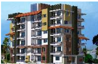
Aadhee Lobo Lane, Mangalore