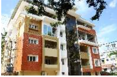
Orion Lobo Lane, Mangalore