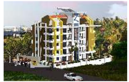
Hathill Crest Hathill, Mangalore