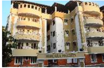
Mercara Heights Mercara Hill Road, Bendore, Mangalore