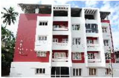
Aria Alvares Road, Mangalore