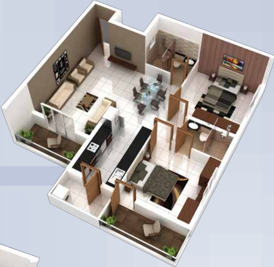
Unit 4: 2 BHK - 1305 sft