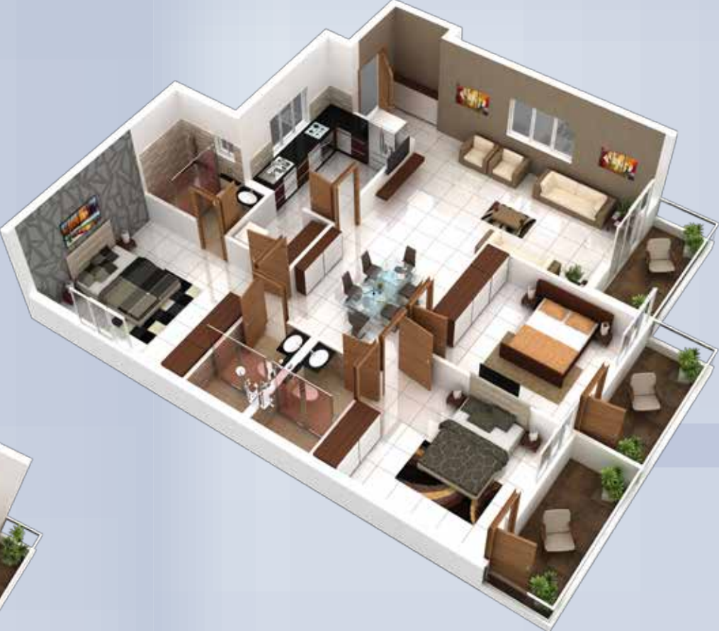
Unit 3: 3 BHK - 1710 sft