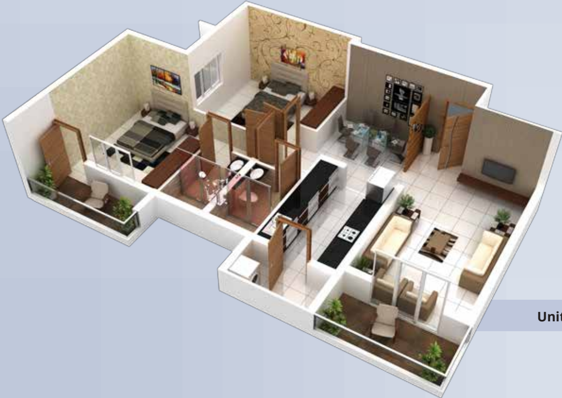
Unit 2: 2 BHK - 1355 sff