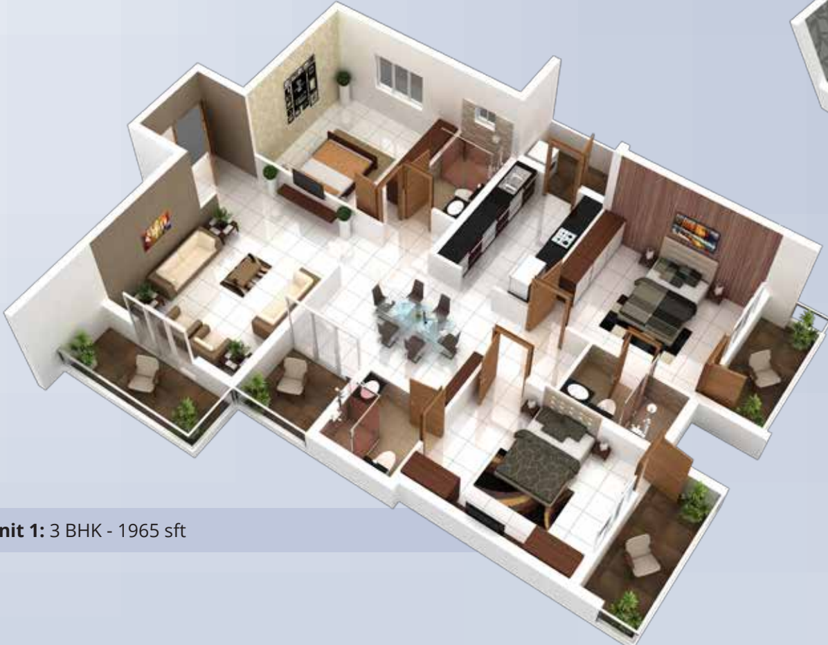
Unit 1: 3 BHK - 1965 sft