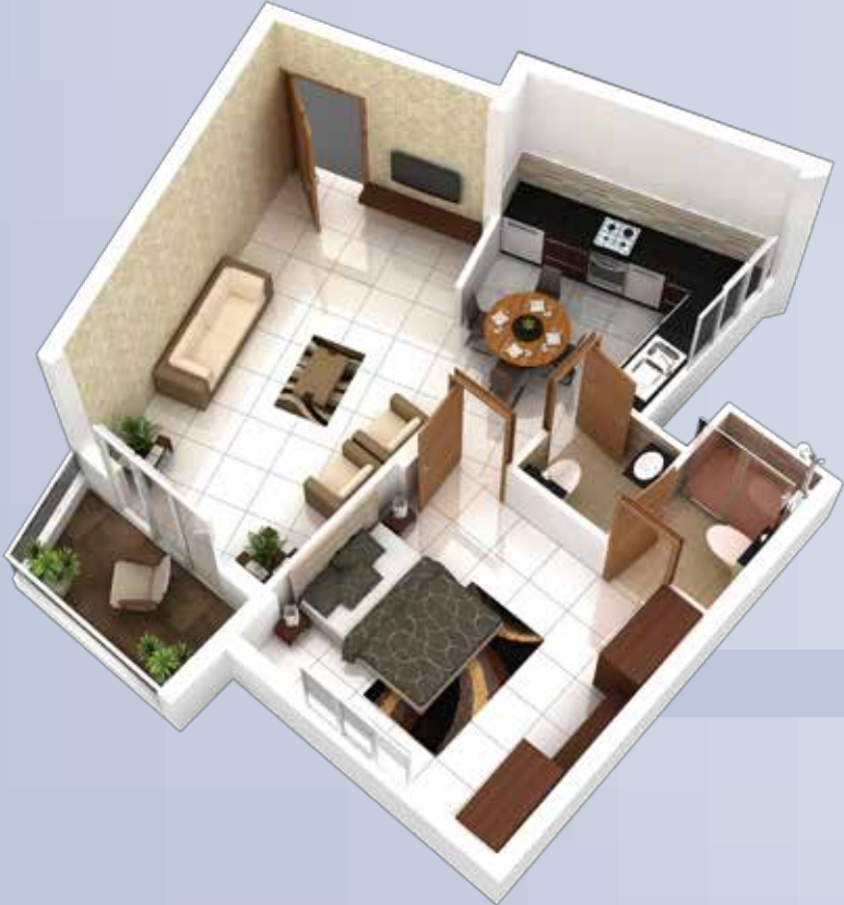
Unit 5: 1 BHK - 760 sft